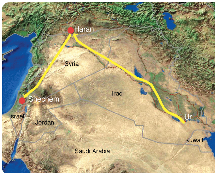
The Fertile Crescent